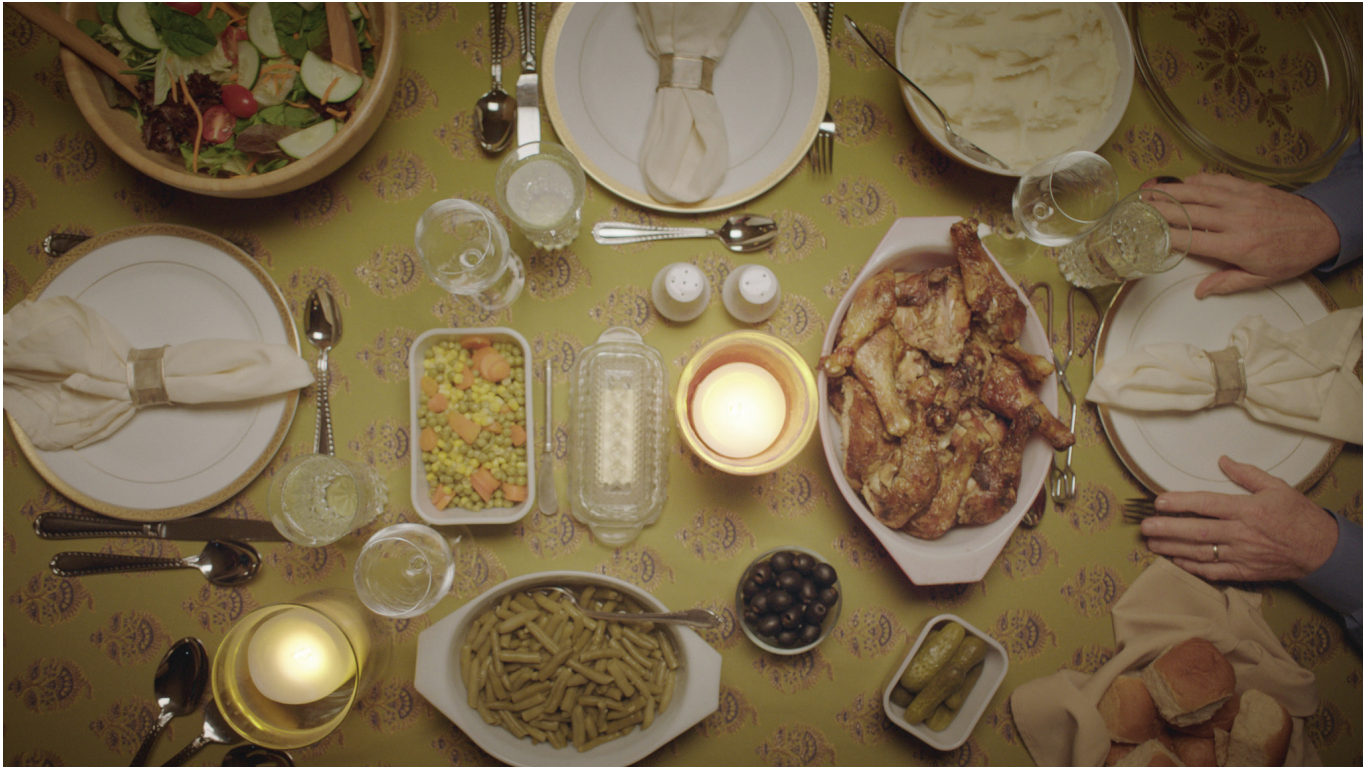
Still from Elwood Takes a Lover . © 2018 University of Southern California